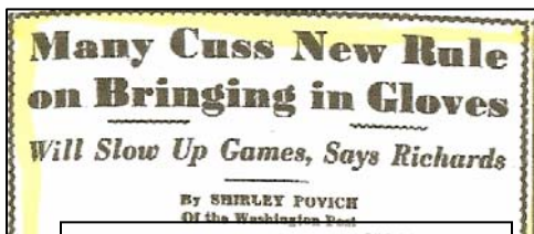
The Sporting News, March 17, 1954, p. 29.

Managers at the time, especially in the American League (such as Paul Richards, Jimmie Dykes, Casey Stengel), voiced their objections (typical was the headline to the left). It may be hard to believe now, but 20 out of the 33 minor leagues also were against the rule at the time.